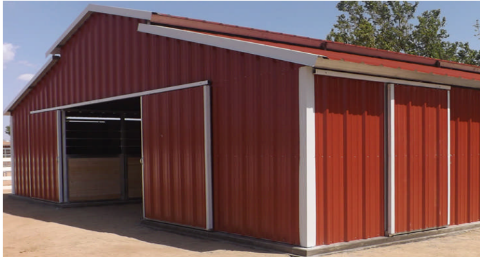
PBR Roof Panel