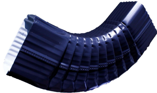
3X4 CORRUGATED B ELBOW