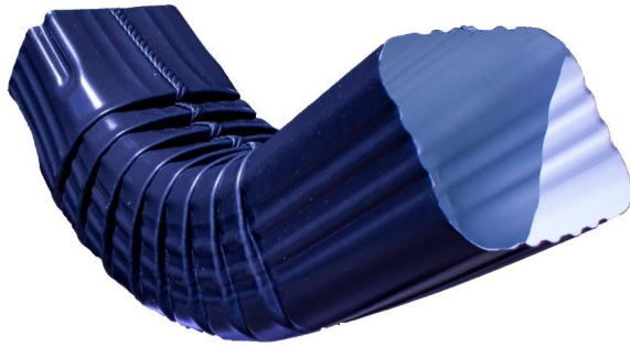
3X4 CORRUGATED A ELBOW