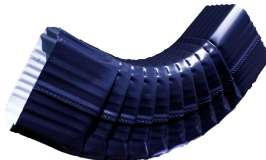
4X5 CORRUGATED B ELBOW