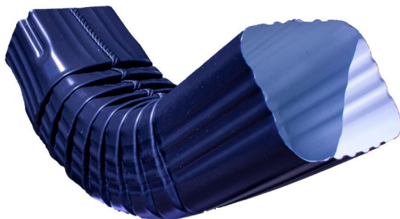
4X5 CORRUGATED A ELBOW