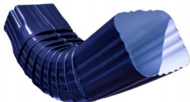
3X4 CORRUGATED A ELBOW