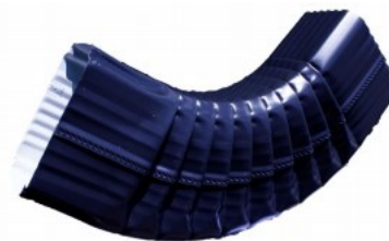
3X4 CORRUGATED B ELBOW