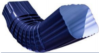
3X4 CORRUGATED A ELBOW