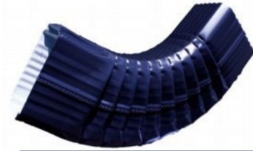
3X4 CORRUGATED B ELBOW