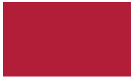
REGAL RED *