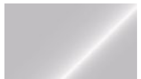
SILVER METALLIC *✓ 0