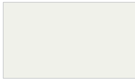
BONE WHITE ✓