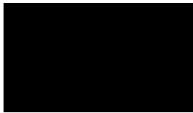
MATTE BLACK ✓