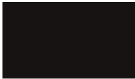
EXTRA DARK BRONZE ✓